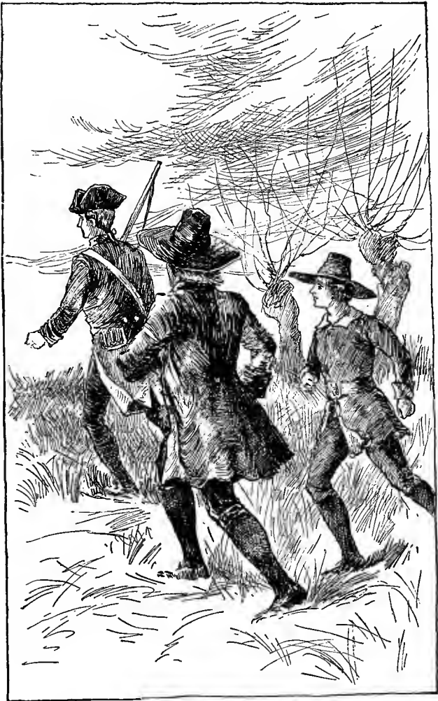
“They sped rapidly across the marsh.”—See page 46.